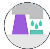
MJ Material Jetting